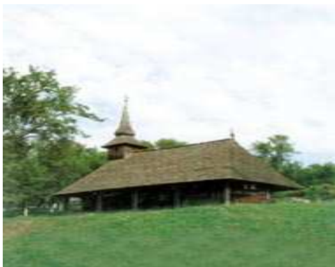
Fig. 3 The wooden churches of the Crooked Abbey

The holy ABBEYS Crooked Abbey, whereat began the construction of the abbey flapped the century XV, rather from the year 1470. After break activity for precinct 280 of years, firm in 1993 her reestablishment. The name comes seemed from a crooked faithful the lame which bequeathed the place church. The location was found out to the brim of the village Păduriș what appertains common Hida (fig. 3), be alone friary from the county Salaj again alone building the ex monastic which ensemble is kept and today is the wooden church, with the keepsake" Adormirii The nun Of the God", that after the year 1996 he built a new monastic which were holy in 15 August 2002.