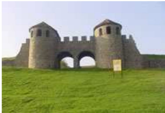
Fig. 1 Porta Praetoria

The Roman castrum from Porolissum (fig. 1), most strong fortification with role of defense from of north-west the province Dacia Of the novel. Is seated on hill of Moigrad and massive Pomăt and Citera, really natural bastions of defense, carry constituted developmental the area of the best famous the Rumanian town from northwestern territory of Romania. Northern most town of Dacia, putted in he Carries Mesesului.