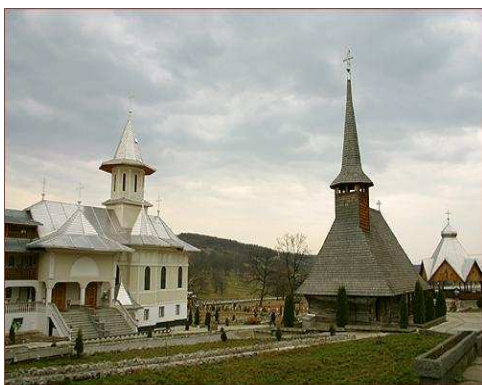
Fig. 4 The abbey" Sf. Third" from Bic

The abbey" Sf. Third" from Bic (fig. 4), is placed to five kilos of the town Simleu Silvaniei and carries the keepsake" Cut head Sf. Joan the Baptize" were putted the in the year 1720, the new church and the larders. He is alone abbey duration in Salaj after the year 1700. From spring until the snow put on the hills of Salaj the courtyard of the abbey is flower, I carry yes give birth to of a true cascades of colors and another fragrances abbeys are to Rus in the passage of the valley of Somes and to Bălan on Skidoo Almas.